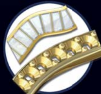
Stone Channel and rail builder