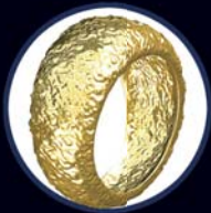
3D textures and bas-relief