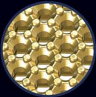
Advanced pavé, ajour and prong placement