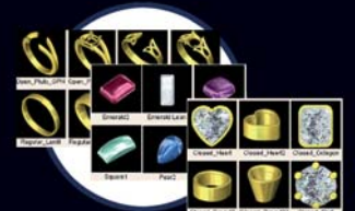
Catalog of components (incl. CRYSTALLIZED™ Swarovski)